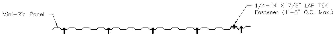
FASTENER PATTERN (@ Intermediate Purlins)