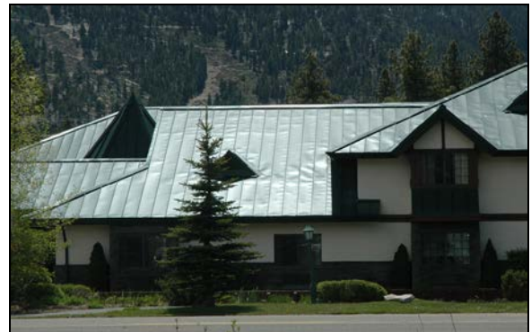
(Above) The only difference is an hour in time and the changing angle of the sun