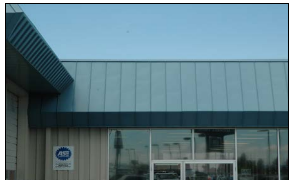
(Above) These photos were taken minutes apart, from different camera angles