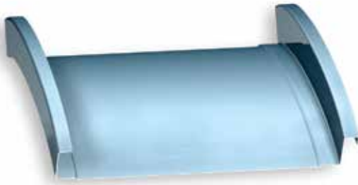
Illustration of Maxima ADV

Maxima ADV features a 2" standing seam Maxima 1.5 features a 1.5" standing seam