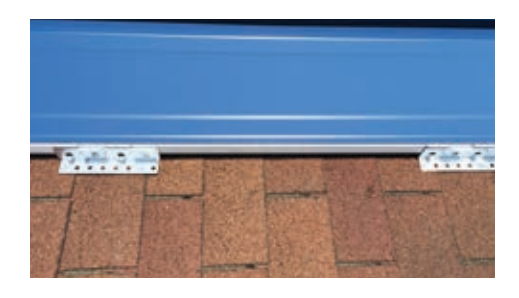
Image shows clip seated on two shingles with fasteners through lower ends of the shingles.