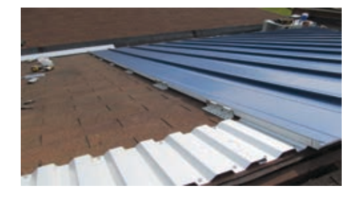
Corrugated sheeting installed at the ridge allows for continuous air flow between the existing and new roof while providing support for the panel and closure.