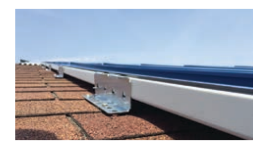
The patent pending 138T Shingle Recover Clip is installed with two fasteners into the existing substrate and allows for a 3/4" airspace between existing and new roofs.