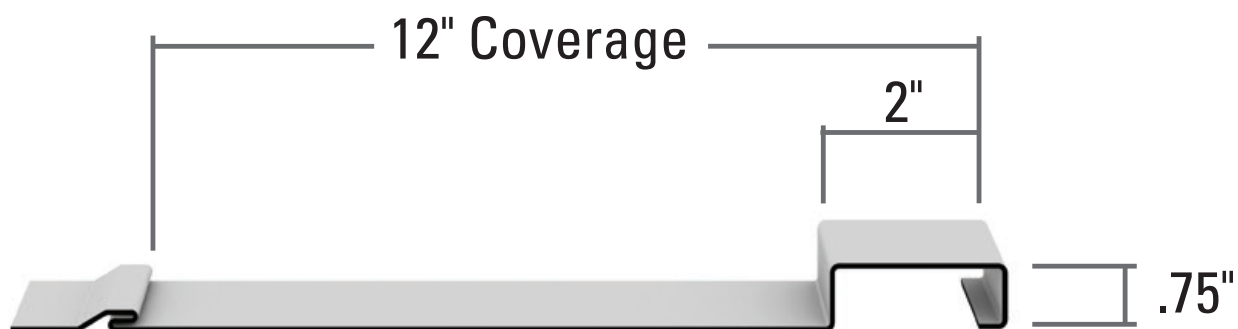
Nostalgia Board & Batten