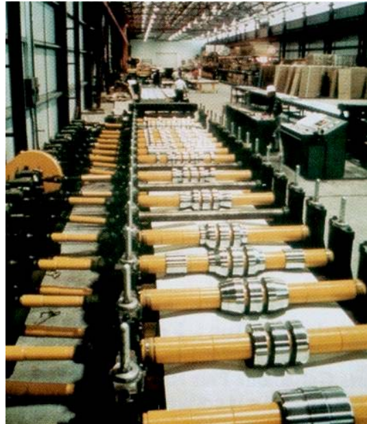
ACRYLUME ® Sheet can be roll-formed without use of oil

ACRYLUME ® Coated Sheet Steel was developed to allow roll-forming without the need for additional lubrication. This product provides the added benefits of greater resistance to hand and foot printing and will weather more uniformly. For highly visible applications, ACRYLUME ® Coated Sheet has limitations. Since the acrylic passivation system is a thin, temporary, clear coating, differences in base metal surface could be noticeable, particularly if panels from different coils get mixed prior to shipping or at the job site. Also, the clarity of the passivation system may have some variation from one production lot to the next. If uniform appearance is critical to the end user, then a painted product would offer the best solution.